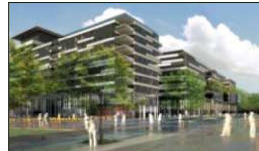
BIONIC HILL Innovation Park project