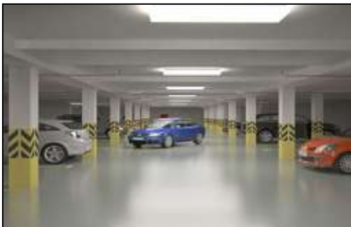
Construction of parking lots